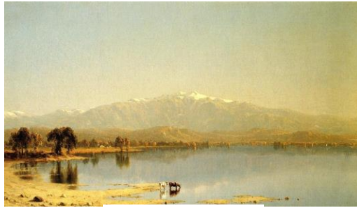
Sanford Gifford October in the Adirondacks Mildred Lane Kemper Art Museum 1860 14.5"x24" o/c