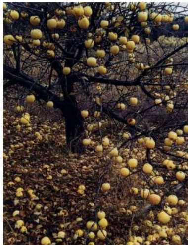
Eliot Porter. Apple Trees After Frost. Tesque, NM 11-21-66