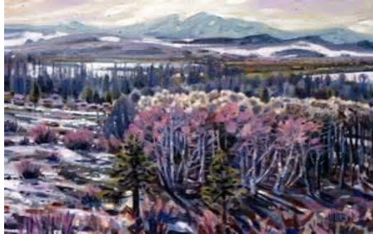
Aspen in April Painting by Donald Maier