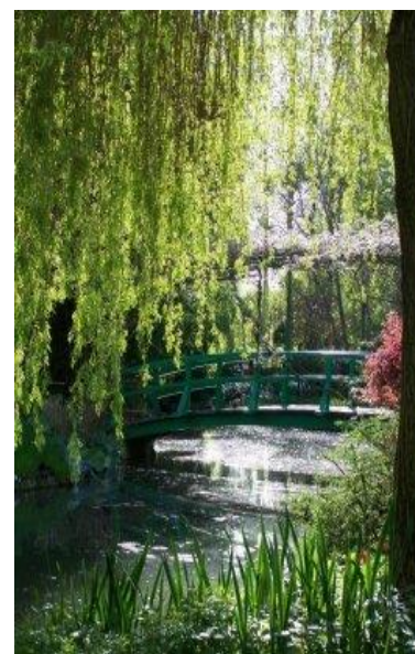
Giverny: April in Monet's garden

MONTHLY MEETING NOON BRASS RAIL ROOM AT DOC'S THE PLAZA RESTAURANT WEDNESDAY, APRIL 10, 2013