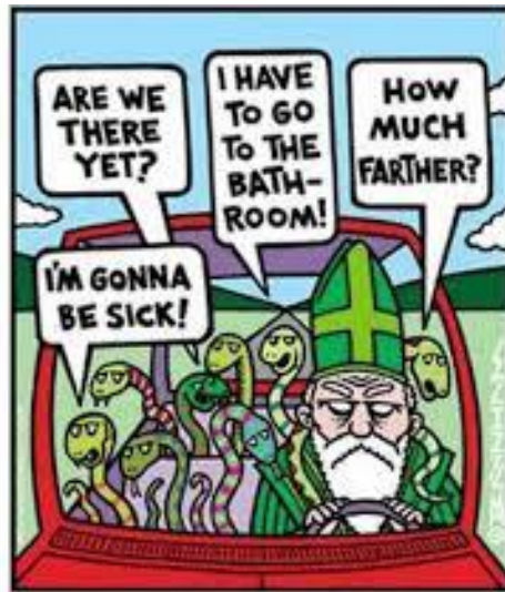
St. Patrick driving the snakes out of Ireland.